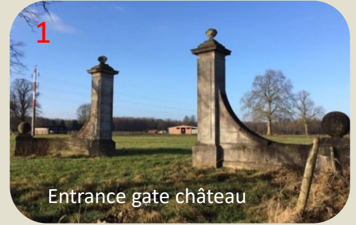
Entrance gate château