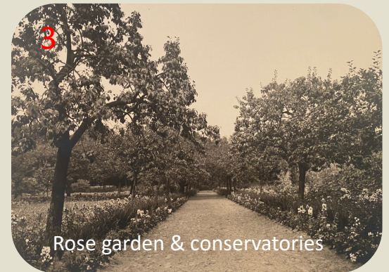
Rose garden & conservatories