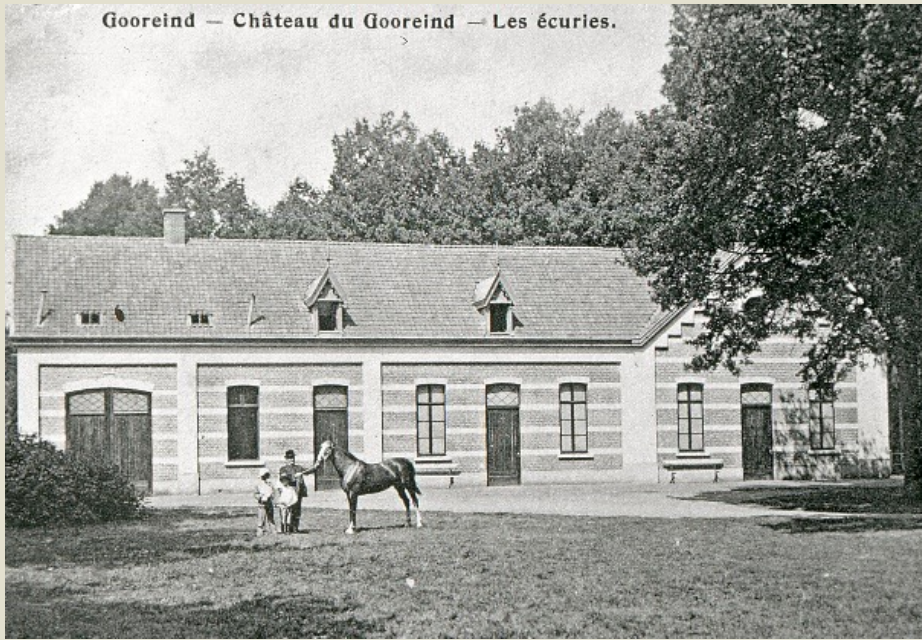
Gooreind — Château du Gooreind — Les écuries.