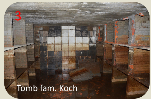
Tomb fam. Koch